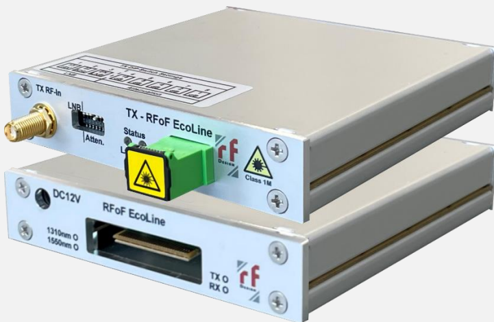
EcoLine TX Module